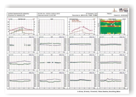
ST SUMMARY REPORT