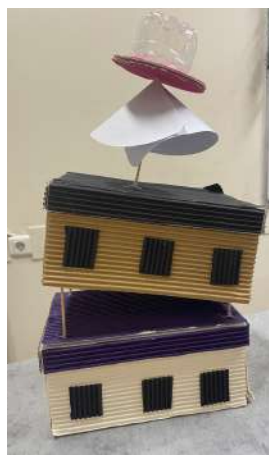
Spaceship wrecking a building