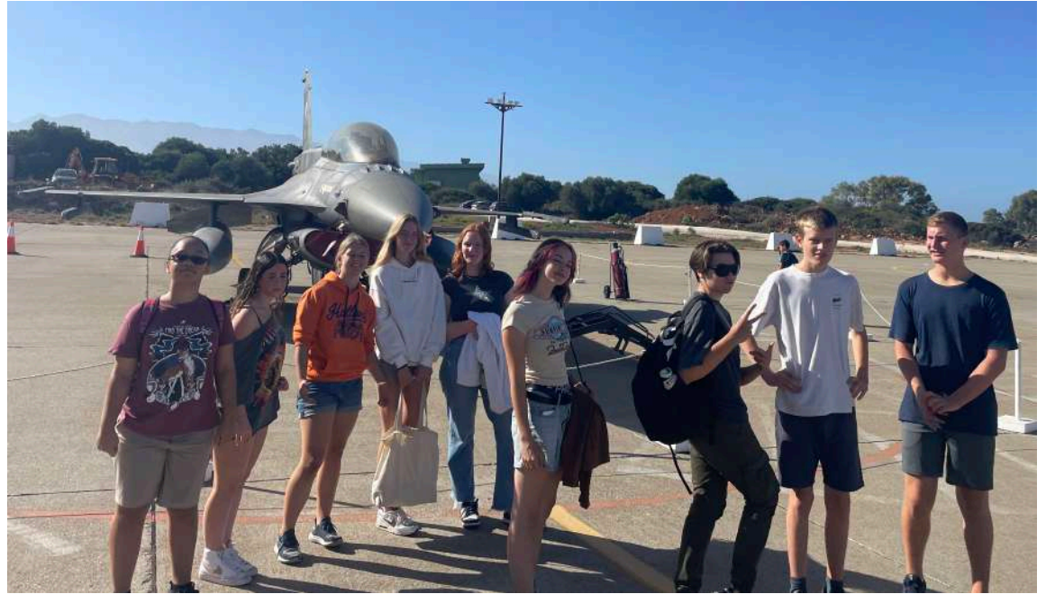
The junior and senior high school are pictured a military jet at the Air Force Base