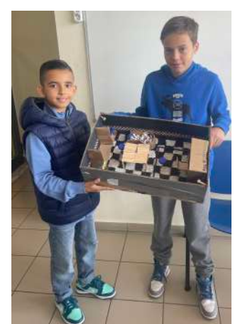
Scene from "Five Nights at Freddy's"