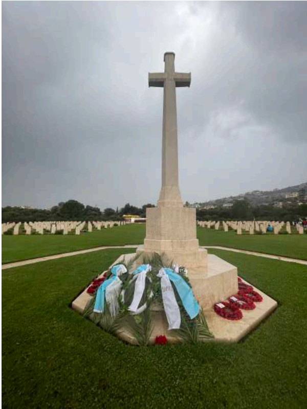
Allied War Cemetery Souda Bay, Crete