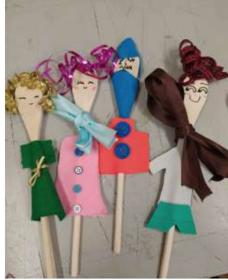
Puppets spoons Project