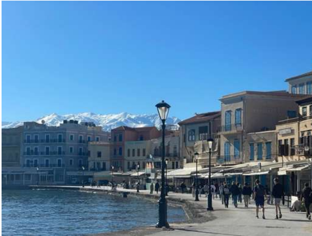
Old Harbor Chania