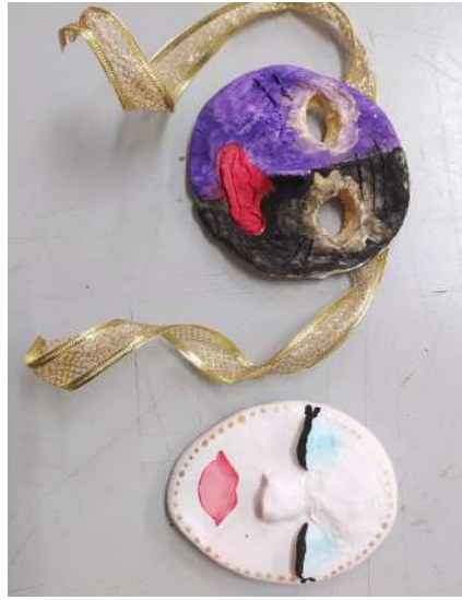
Carnival Clay Masks

7th Grade Lab - The class was learning about synthetic materials and made bioplastics.